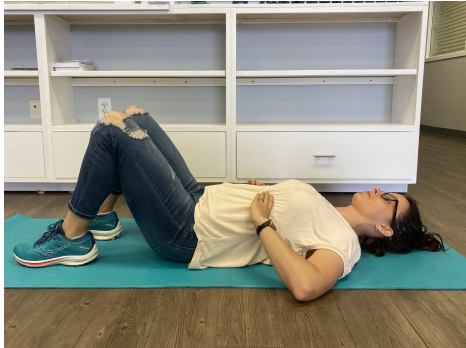
★ Diaphragmatic Breathing